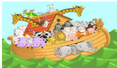
NOAH'S ARK PRESCHOOL (NAP)