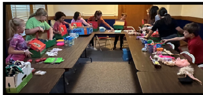
In November, the Elementary Youth Group (EYG) filled Operation Christmas Child shoe boxes, and tried to get through “laser beams”.